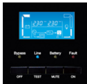
Multifunction LCD display