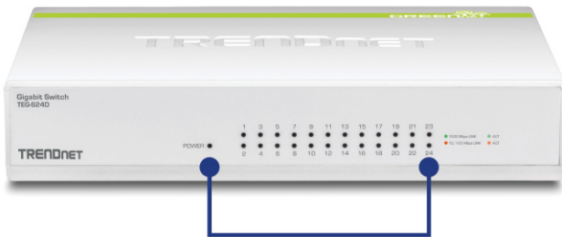
1 LED Indicators